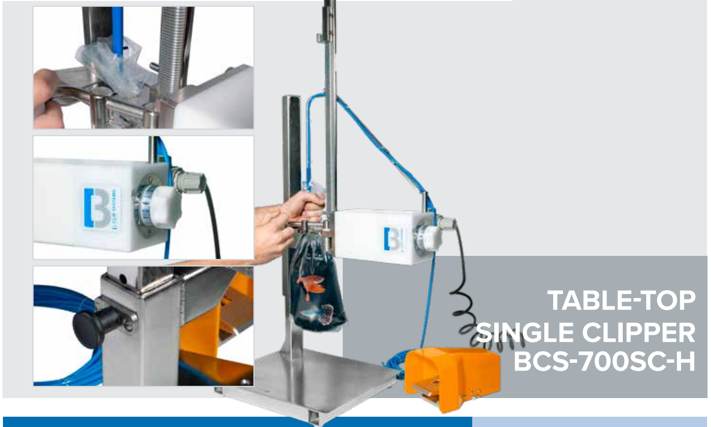
TABLE-TOP SINGLE CLIPPER BCS-700SC-H