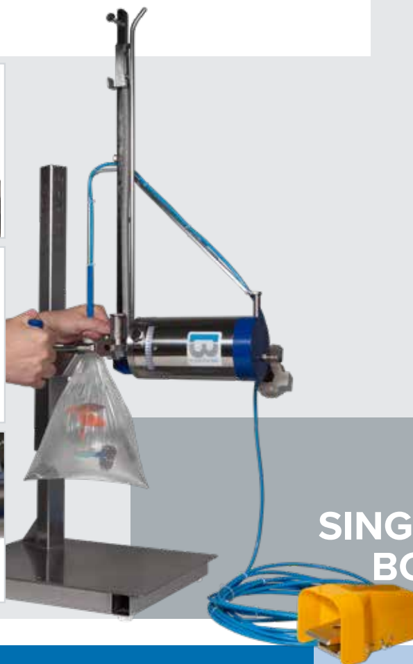
TABLE-TOP SINGLE CLIPPER BCS-700SC-H