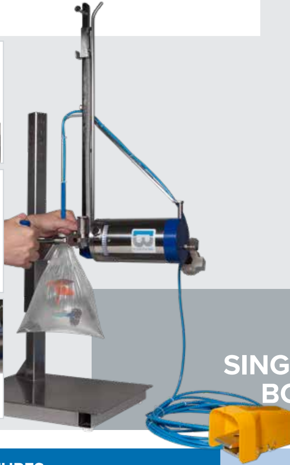
TABLE-TOP SINGLE CLIPPER BCS-700SC-H